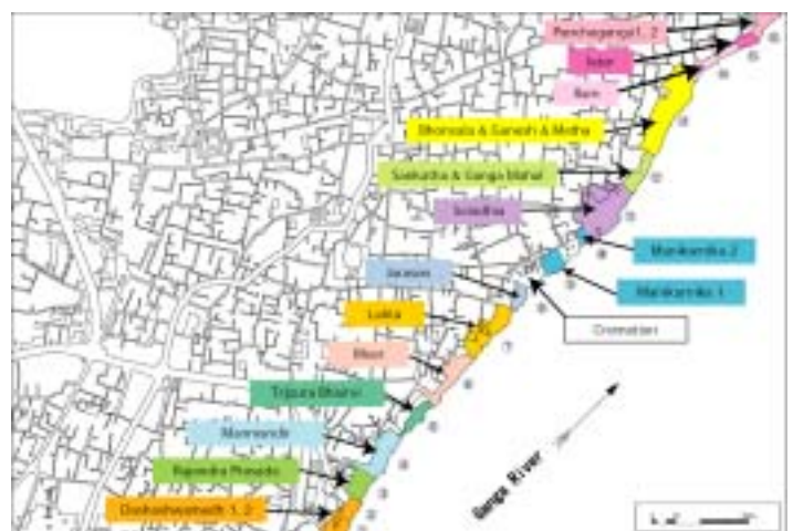
Fig.2 Hearing Research Site (Ghat Decoration)